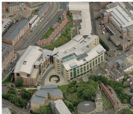
Microsoft Virtual Earth - Engica Technology, Trinity Gardens

Engica's UK Headquarters is based at One Trinity which is situated at Trinity Gardens by the Newcastle Quayside and Law Courts.